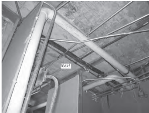
Figure 2 – Utilities limited access to the underside of the beams