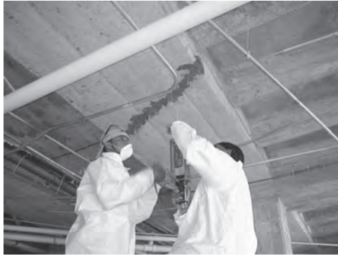
Figure 4 – Crack injection prior to strengthening of beams