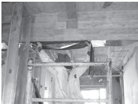
Figure 6 – Saturated fabric is bonded to the beam surface covered with tack coat