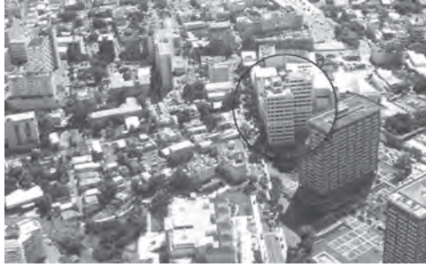
Figure 1 – Aerial View of the Plaza de Diego Building