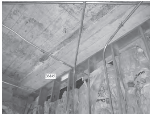
Figure 8 – Partition wall framing running along the beam axis