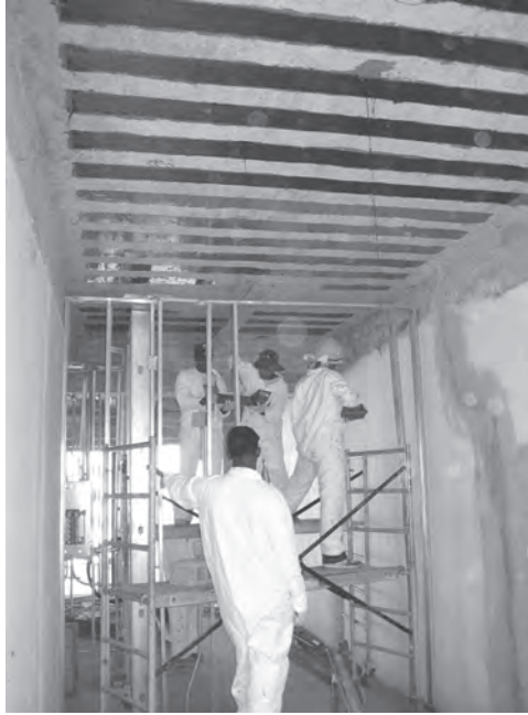
Figure 10 – Strengthening of slab with carbon fabric