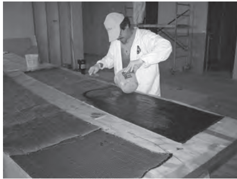
Figure 5 – Saturating of carbon fabrics by hand