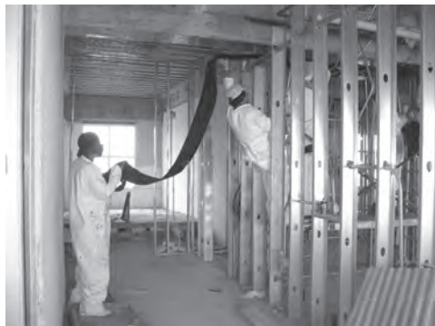
Figure 3 – Partition wall framing limited access throughout the floor