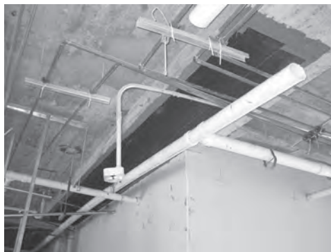
Figure 9 – Two layers of fabric were used when the tension face of the beam was not fully accessible